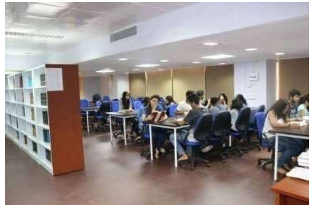
Library Reading Hall

The faculties at MNLUMumbai are regularlyinvolved in contributing to the knowledge domain through publication in journals of high repute. Further to provide a platform for wider dissemination of knowledge, 'MNLU Mumbai Law Review', a faculty initiated bi-annual journal is published regularly.