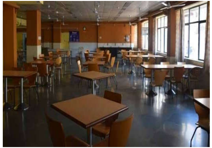
Hostel Dining Hall

The five year integrated B.A.,LL.B.(Hons.) Programme offered by the University is designed in accordance with the approved norms of the